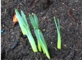
First signs of spring spotted on the first day back!

Environmental Science - This term the children are continuing to observe and photograph the seasonal changes in the trees and other plant and animal life in the school environment. They will also be identifying the birds seen in the school grounds and in the local parks and taking part in Birdwatch.