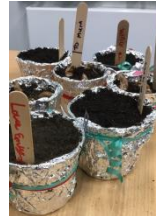
Please remember to water the bulbs in your pots.